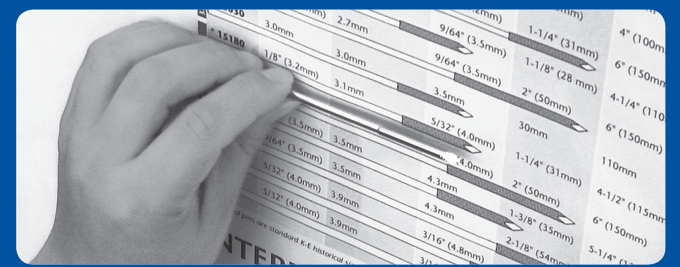
Pins drawn to actual size (Overlay Guide Length Variations +/-1.6mm)